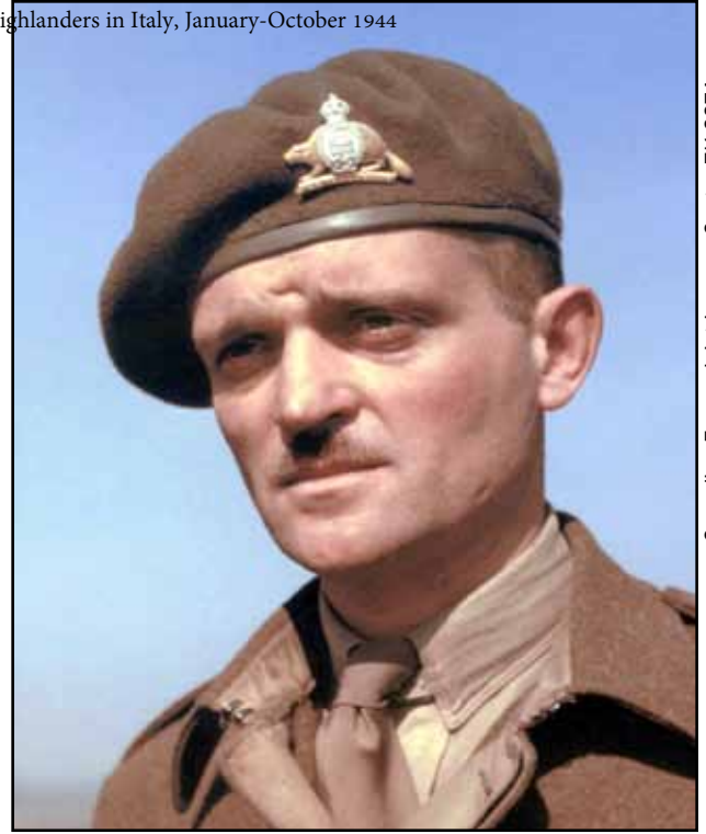
Major Paul Triquet joined 1 Canadian Base Reinforcement Depot as the second-in-command of 1st Battalion. As a recent Victoria Cross recipient his battle experience would have been useful in preparing new troops for combat.

The army also sought to ensure training at 1 CBRD met front-line needs by posting veterans into the depot as instructors. In January 1944 the 48th Highlanders alone sent seven NCOs to 1 CBRD on an exchange program. 47 Later, in June 1944, the army planned to exchange officers and NCOs between operational field units and 1 CBRD's permanent staff. The aim was to furnish reinforcements with relevant, high-quality training, while providing less stressful employment to soldiers who had served in the line for prolonged periods. At the same time, the scheme would allow instructors from the reinforcement depots to gain valuable combat experience. 48 On 21 September, the Royal 22nd Regiment's Major Paul Triquet, a national hero who was awarded the Victoria Cross the previous December for his heroism and leadership in battle, joined 1 CBRD as the 1st Battalion's second-in-command. 49 On 7 October, the 48th Highlanders sent another two