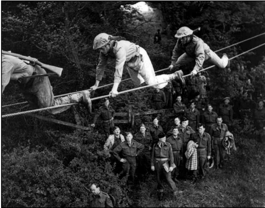
Library and Archives Canada PA 132776

3-inch mortar and 6-pounder anti-tank gun courses that lasted three and four weeks respectively. 21