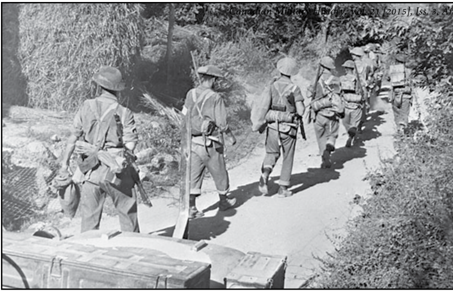
Infantrymen of the 48th Highlanders of Canada advancing on Point 146 during the advance on the Gothic Line near the Foglia River, Italy, 28-29 August 1944.

NCOs to 1 CBRD to assist in the training of personnel remustered to infantry. 50 Other operational units almost certainly did likewise.