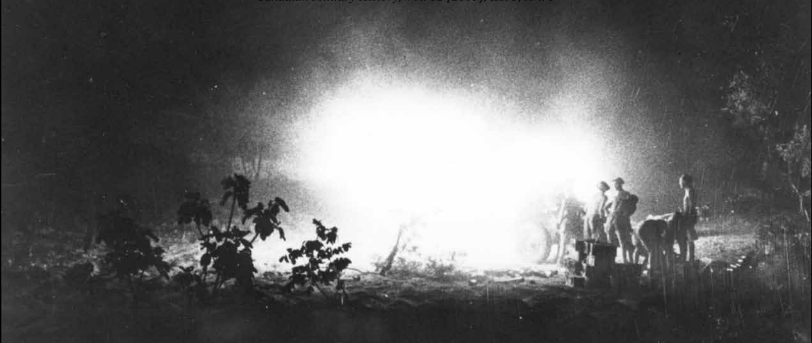
A 3-inch mortar crew firing on enemy positions north of Nissoria, 28 July 1943.

proceeded on foot behind the Royal Canadian Regiment in the direction of NISSORIA. The plan was that the Royal Canadian Regiment should move with their left flank on the road and the 48 Highlanders should move astride the road behind them. The Royal Canadian Regiment contacted the enemy sitting on the ridge east of NISSORIA. The 48 Highlanders were ordered into a position on the high ground west of this town and that night the Hastings and Prince Edward Regiment were ordered to pass through to take the ridge where the Royal Canadian Regiment had been held up. Both these battalions lost contact with each other and suffered heavy casualties. It was accordingly planned to put the 48 Highlanders into the attack with a barrage supplied by concentrations from Divisional artillery support at 1800 hours the following day (25 July).