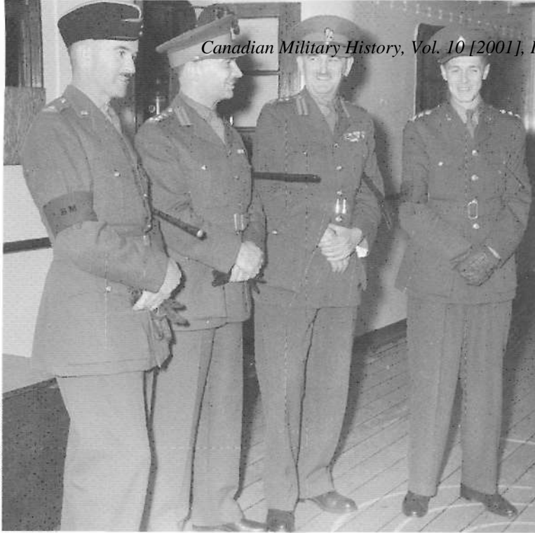
Officers of "C" Force aboard SS Awatea en route to Hong Kong, October 1941.