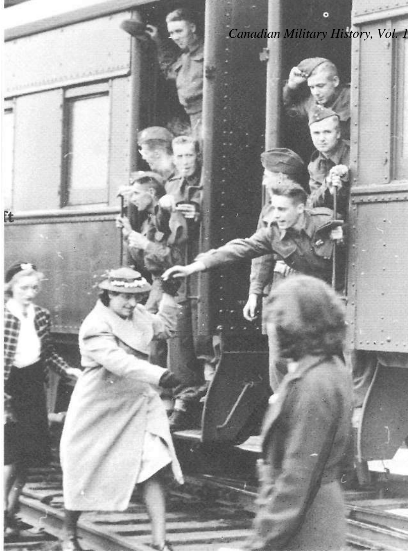
A mother runs along the tracks to say goodbye to her son as he leaves with the Winnipeg Grenadiers, 5 June 1940.