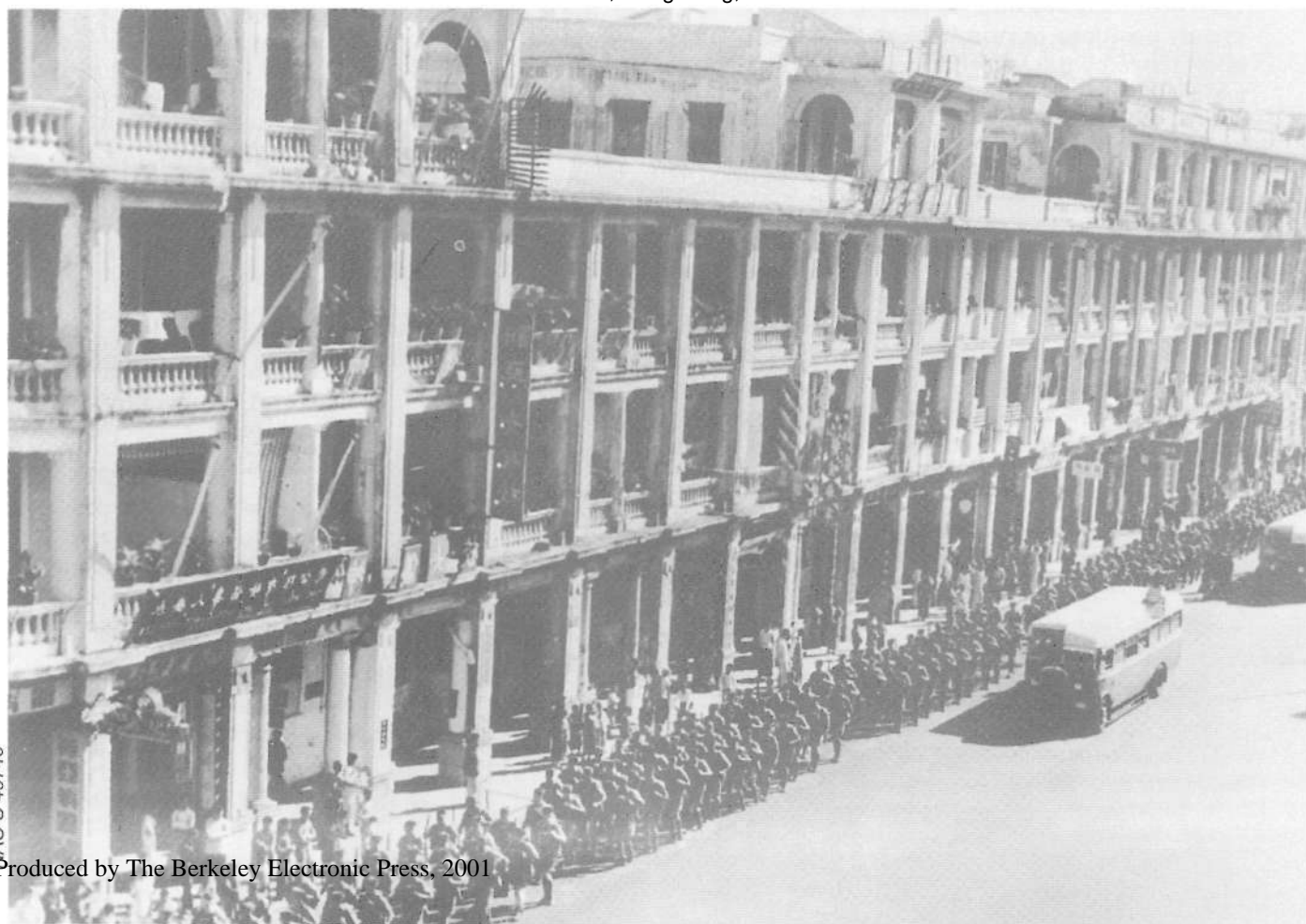
Troops of "C" Force march through Kowloon on their way to the Sham Shui Po Barracks, Hong Kong, 16 November 1941.