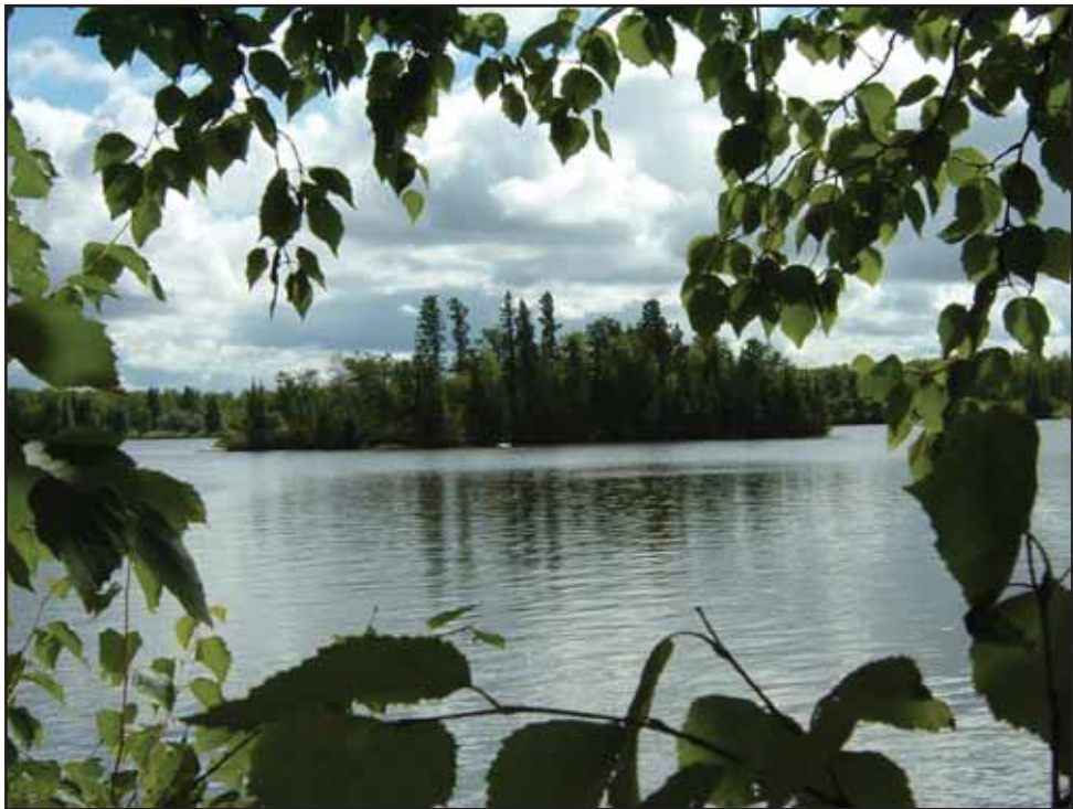
FUREY ISLAND ON THE WINNIPEG RIVER TAKEN FROM THE TRANS-CANADA TRAIL AT THE FOOT OF ABERDEEN AVENUE, PINAWA