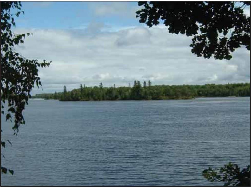
FRENCH ISLAND ON THE WINNIPEG RIVER TAKEN FROM THE TRANS-CANADA TRAIL OFF THE WATER TREATMENT PLANT AT PINAWA