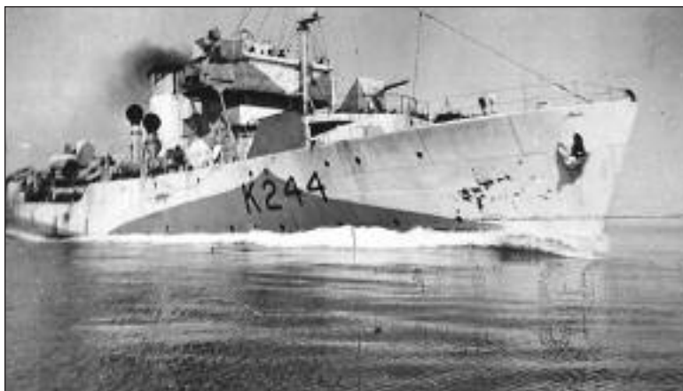
ON SEPTEMBER 11, 1942, HMCS CHARLOTTETOWN (I) WAS DESTROYED WITHIN SIGHT OF HORRIFIED ONLOOKERS ON THE SHORES NEAR CAP-CHAT.

shipping, with its excellent access to Canada's industrial heartland, was a serious threat.