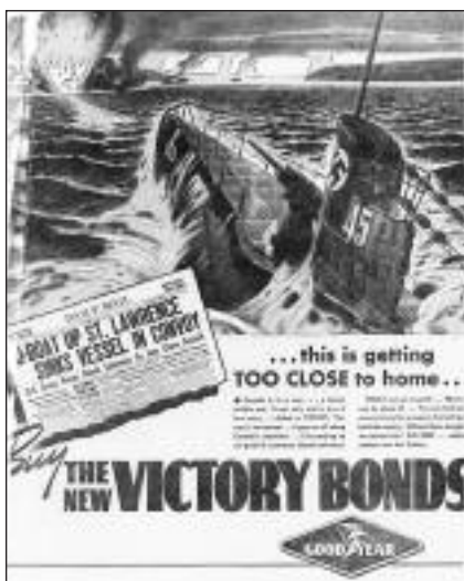
VICTORY BOND ADVERTISEMENT IN THE MONTREAL DAILY STAR , NOVEMBER 2, 1942.

shipping, with its excellent access to Canada's industrial heartland, was a serious threat.