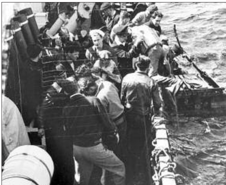
WHEN THE CHATHAM WAS SUNK ON AUGUST 27, 1942, OF THE 562 PASSENGERS AND CREW MEMBERS, ALL BUT 13 WERE SAVED BY THE CREW OF THE HMCS TRAIL, RCAF AIRCRAFT AND US COAST GUARD ESCORTS.