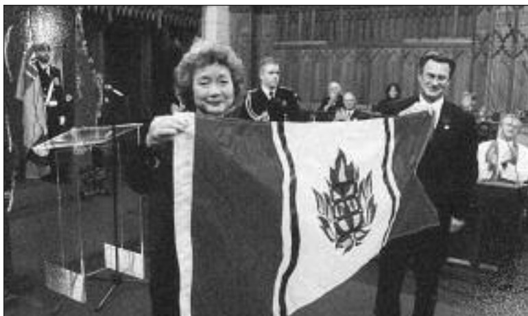
GOVERNOR GENERAL ADRIENNE CLARKSON (LEFT) AND GEORGE BAKER, THE MINISTER OF VETERANS AFFAIRS (RIGHT), DISPLAY THE NEW GULF OF ST. LAWRENCE COMMEMORATIVE DISTINCTION PENNANT DURING CEREMONIES IN THE SENATE CHAMBER. (NOVEMBER 1999)

Many of those whose lives were claimed by the Battle of the Gulf of St. Lawrence have no known grave. Their lives, and their sacrifices, are commemorated on Commonwealth War Graves Commission memorials on both sides of the Atlantic. Those members of the Royal Canadian Navy, the Canadian Army and the Canadian and Newfoundland Merchant Marine whose grave is the sea, are commemorated on the Halifax Memorial. Members of the Royal Canadian Air Force who lost their lives in the Gulf theatre and whose last resting place is unknown, are commemorated on the Commonwealth Air Forces Ottawa Memorial. The names of Royal Navy personnel whose lives were claimed by the waters of the Gulf, are inscribed on the Plymouth Naval Memorial or the Lowestoft Naval Memorial in the United Kingdom.