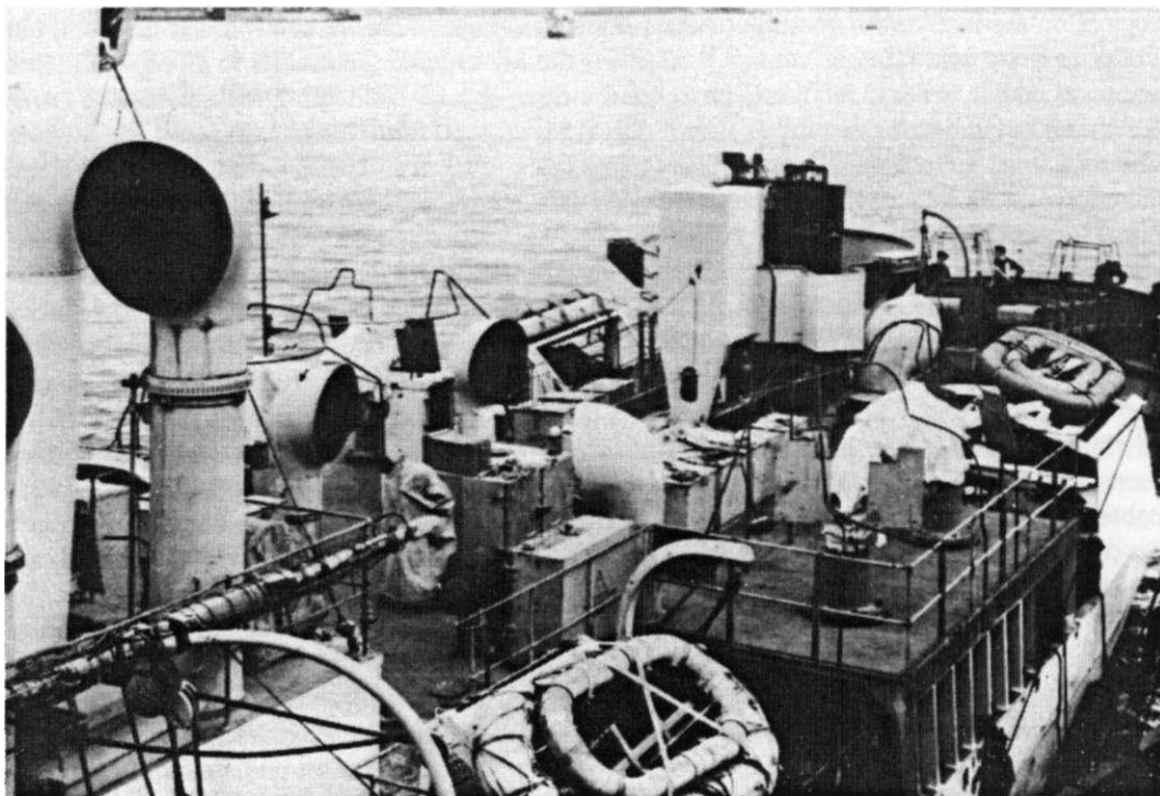
Figure 1: Corvettes destined for Operation Torch received additional firepower prior to leaving Canadian waters. HMCS Kitchener , awaiting departure in Halifax in September 1942, now carries a 2-pdr pom-pom in the after gun tub and four additional 20-mm Oerlikon guns on new extensions of the engine room casing deck.

The next Torch convoy to sail for North Africa was KMS-4. HMC Ships Port Arthur , Baddeck , Alberni , Ville De Quebec and Summerside (Twenty-Sixth CEG) weighed anchor on 26 November in company with EG-30 and four ships of the Fifteenth Minesweeping Flotilla to escort fifty-five vessels to Oran and Algiers. 29 This was the first Torch convoy escorted by an entire Canadian Escort Group as part of the Admiralty's desire "to keep together escorts accustomed to working together particularly in view of the present concentration of U-boats on either side of Gibraltar." 30 This policy, coupled with A/S exercises prior to sailing, paid off particularly for groups which had not previously worked together. 31 Such was the case for the escorts of KMS-4. The passage was uneventful and the convoy arrived safely off Gibraltar on 8 December. The corvettes detached to refuel and sailed the same day to rejoin the convoy. 32 After escorting KMS-4 to Oran and Algiers the warships escorted convoy MKS-3 (Mediterranean-UK-slow) back to the UK.