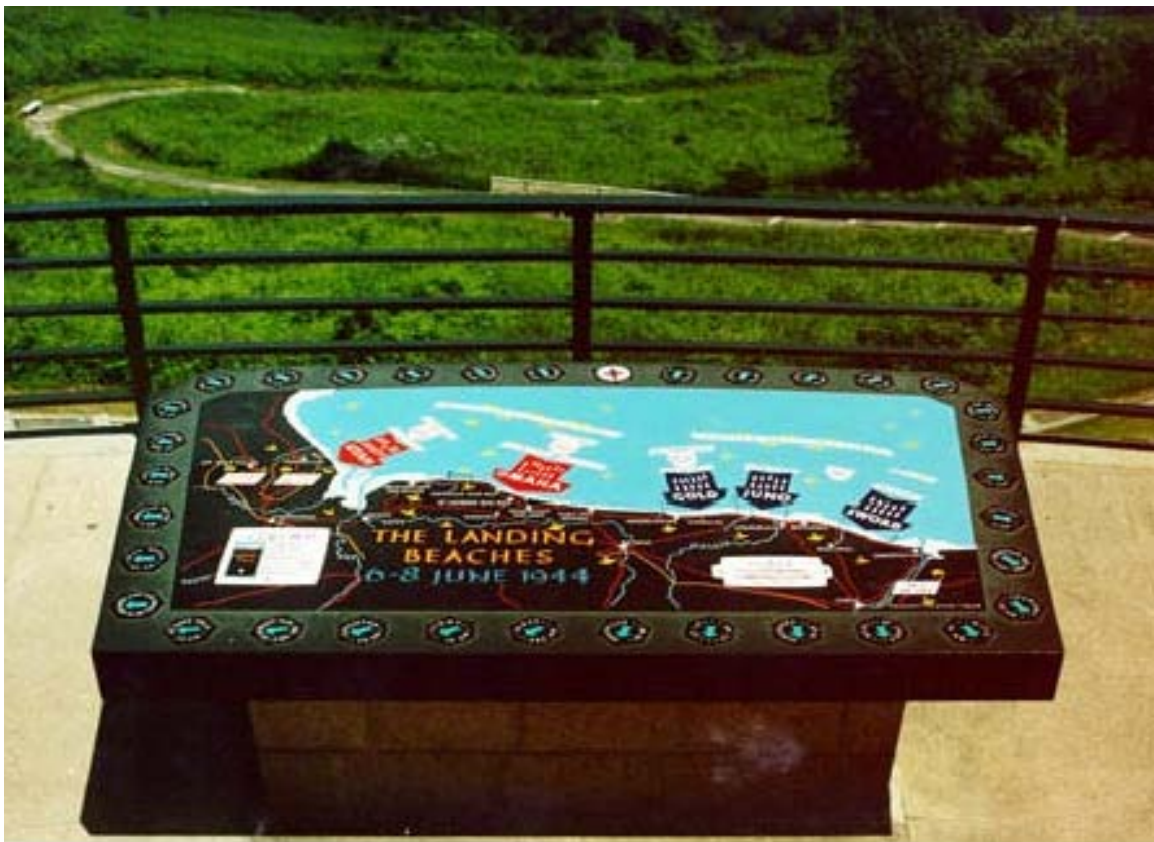
Orientation Table at the Overlook

Americans took St. Lo. Preceded by a paralyzing air bombardment on 25 July, the U.S. First Army stormed out of the beachhead area. Coutances was liberated three days later and, within a week, the recently activated U.S. Third Army cleared Avranches and was advancing toward Paris on a broad front.