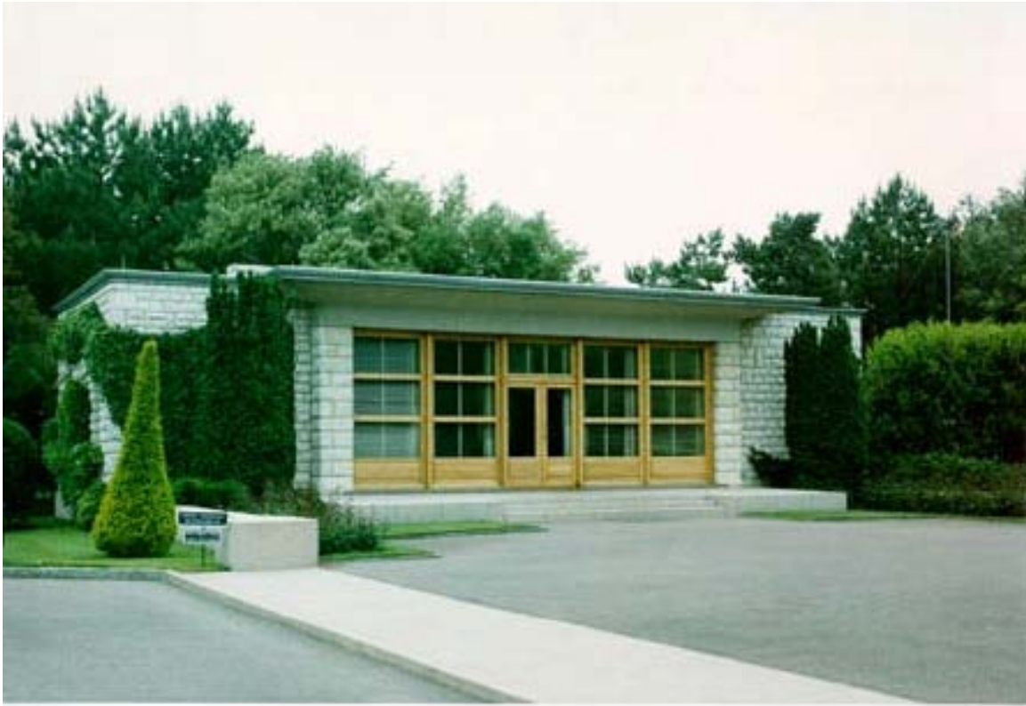
Exterior of the Visitors' Building

The Visitors' Building is located to the left of the parking area at the head of the path leading to the memorial. It contains the Superintendent's office, toilet facilities, and a comfortably furnished room where visitors may obtain information, sign the register and pause to refresh themselves. During visiting hours, a member of the cemetery staff is available in the building to answer questions and provide information on burials and memorializations in the Commission's cemeteries, accommodations in the vicinity, travel, local history and other items of interest.