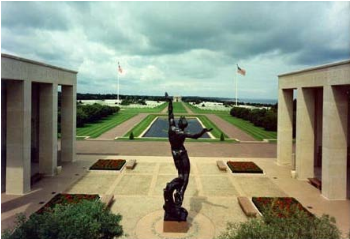
View of the Cemetery from the Memorial

The map on the west wall of the south loggia is entitled " AIR OPERATIONS OVER NORMANDY MARCH-AUGUST 1944 " and depicts air operations prior to the landings to include isolation of the beachhead area from the interior of France.