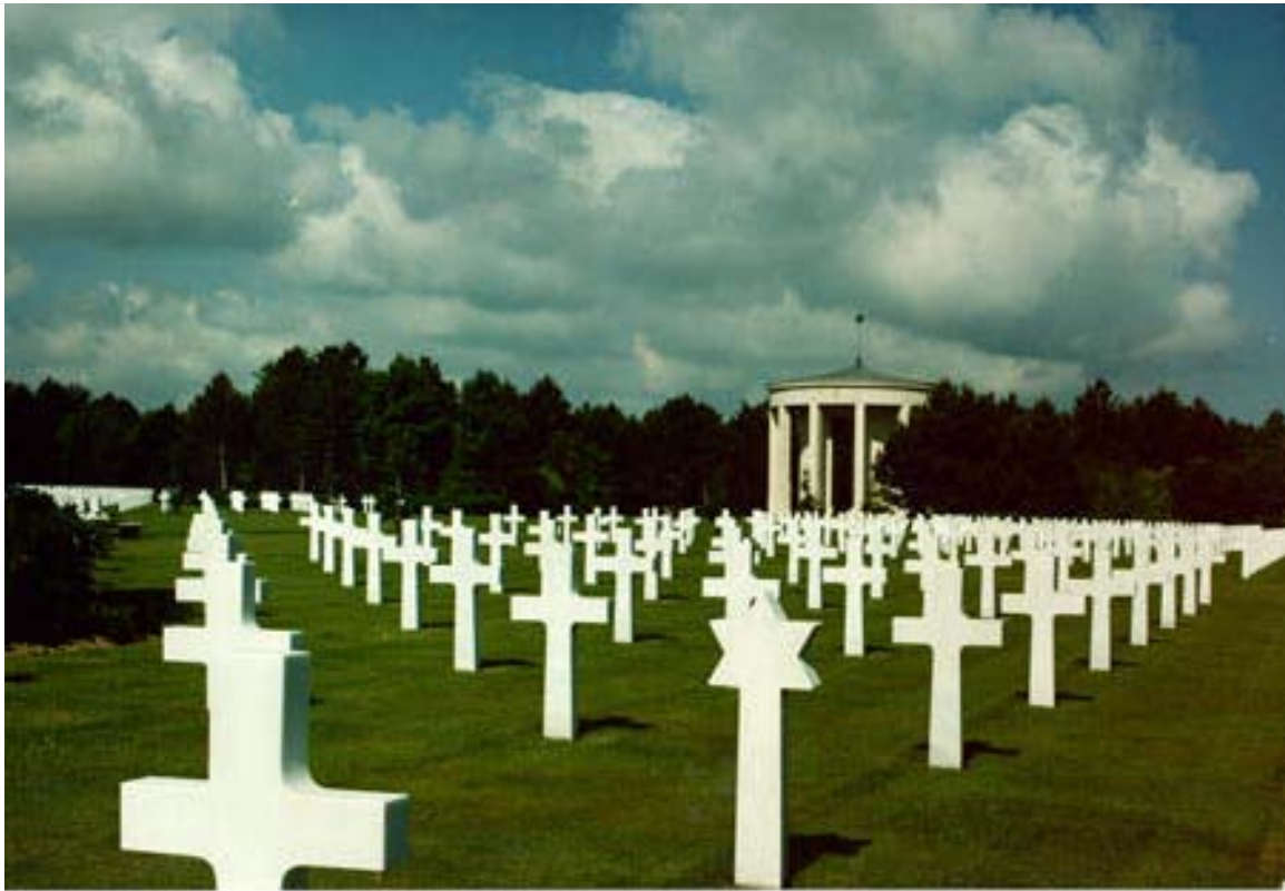
Graves Area with the Chapel in the Background

At the rear of the memorial colonnade on the western side of the garden is inscribed this extract from the dedication by General Dwight D. Eisenhower of the "Golden Book" now enshrined in St. Paul's Cathedral in London: