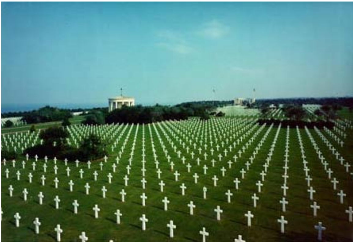
Graves Area with the Chapel and the Memorial in Background

Further to the east on Gold, Juno and Sword landing beaches, the British and Canadian divisions forged steadily ahead. Within a week, under the cover of continuous naval gunfire and air support, the individual beachheads were linked together. Temporary anchorages and artificial harbors were constructed off the beachhead area during this period by sinking ships and anchoring prefabricated concrete caissons to the channel floor, facilitating the unloading of troops and supplies.