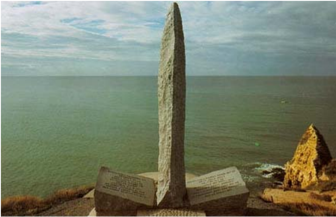
Pointe du Hoc Monument