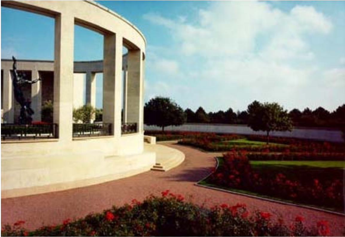
Garden of the Missing