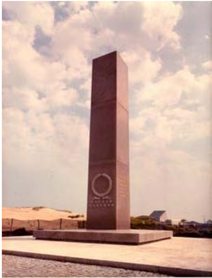
Utah Beach Monument

The Utah Beach Monument is located at the termination of Highway N-13D, approximately 3 kilometers northeast of Ste-Marie-du-Mont (Manche), France. This monument commemorates the achievements of the American Forces of the VII Corps who fought in the liberation of the Cotentin Peninsula from 6 June to 1 July 1944. It consists of a red granite obelisk surrounded by a small, developed park overlooking the historic sand dunes of Utah Beach, one of the two American landing beaches during the Normandy Invasion of June 1944.