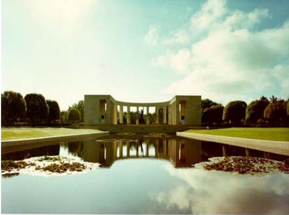
Memorial from the Reflecting Pool

From the overlook, steps and a path descend to the beach. Along the path is a second orientation table showing the artificial harbor or "Mulberry" in some detail. Prior to the 1944 landings, the enemy had installed artillery and machine-guns along the cliffs so that it could fire lengthwise along the beaches. The cemetery is surrounded on the east, south and west by heavy masses of plantings.