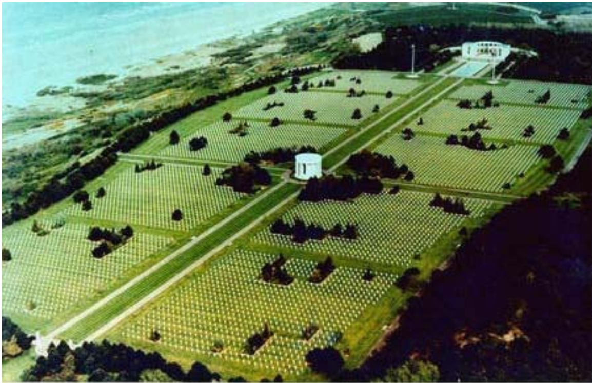
Aerial View of the Cemetery, the Chapel and the Memorial

The road distances to the cemetery from some of the other cities in France are: Le Havre, 94 miles (152 kilometers); Caen, 29 miles (46 kilometers); Rouen, 110 miles (177 kilometers); and Cherbourg, 50 miles (81 kilometers). Adequate hotel accommodations are available in Caen and Bayeux as well as in surrounding villages.