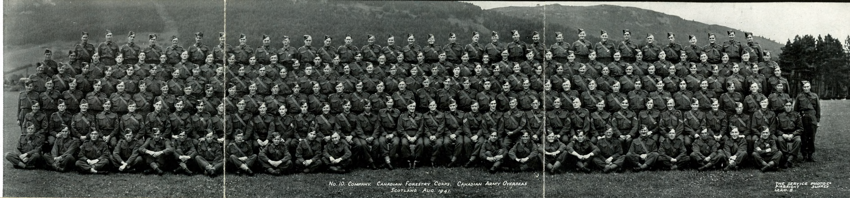
No. 10. COMPANY. CANADIAN FORESTRY CORPS. CANADIAN ARMY OVERSEAS SCOTLAND AUG. 1941.