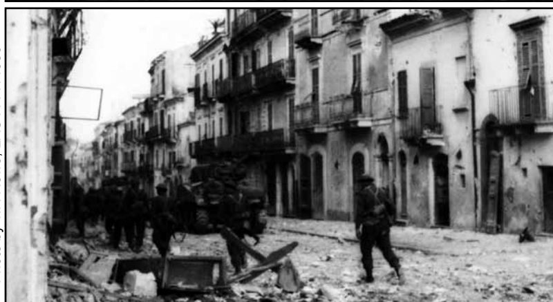
Top: At the end of a slugging match a Canadian Sherman, probably from the Three Rivers Regiment, rumbles into the main square of Ortona. The fury of the fighting can be seen by the wrecked buildings.