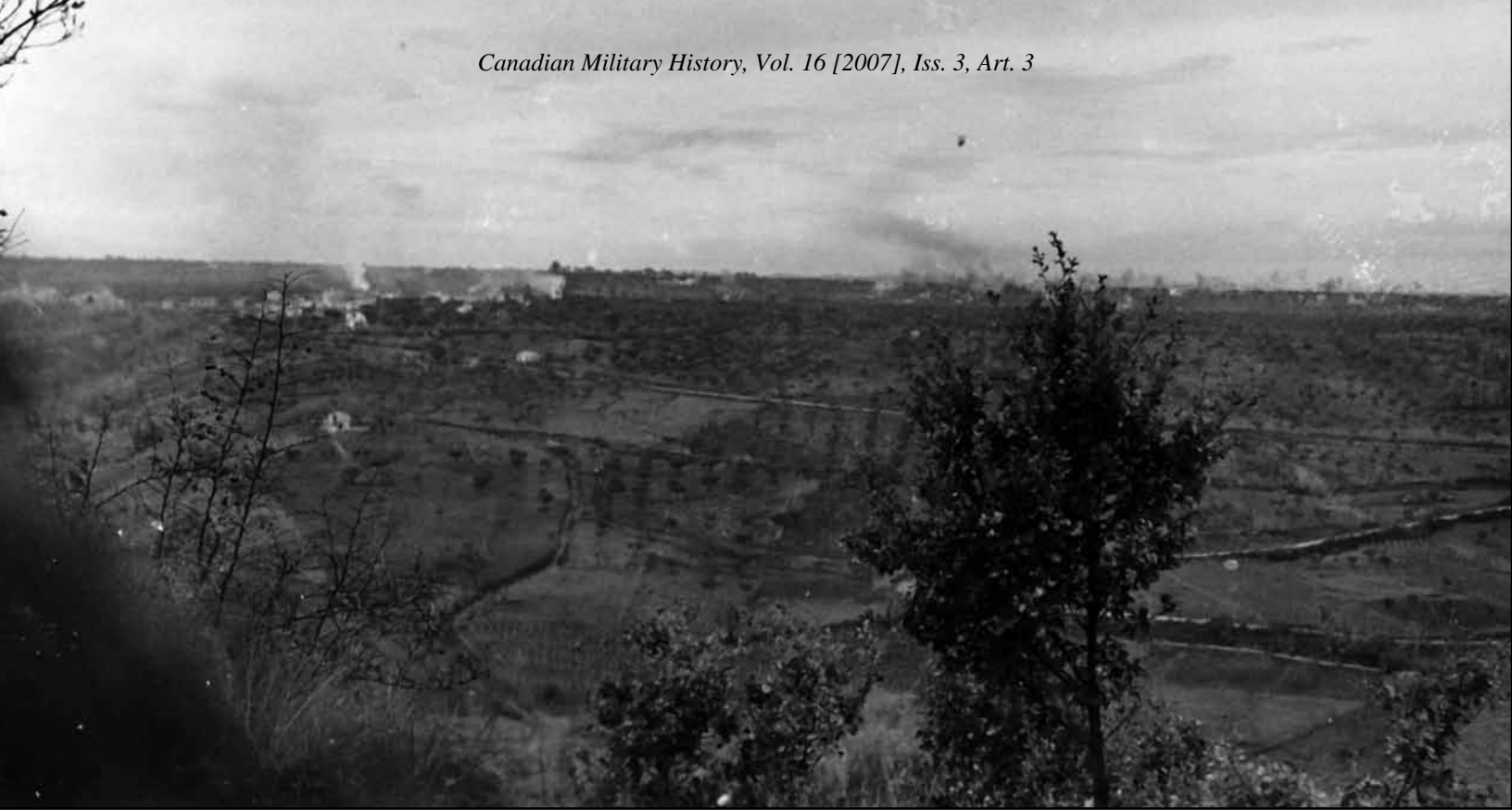
An aerial view of the Canadian artillery barrage which preceded the attack on the Moro River by 1st Canadian Infantry Division, 8 December 1943.

dismounted infantry in mountainous terrain, 32 the amount that the mules could actually carry was limited. The mules could only augment, not replace, wheeled transport.