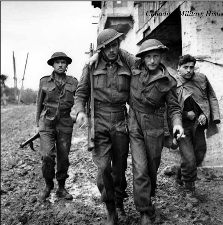
Photo by F.G. Whitcombe, LAC PA 114487 Photo by F.G. Whitcombe, LAC PA 167913